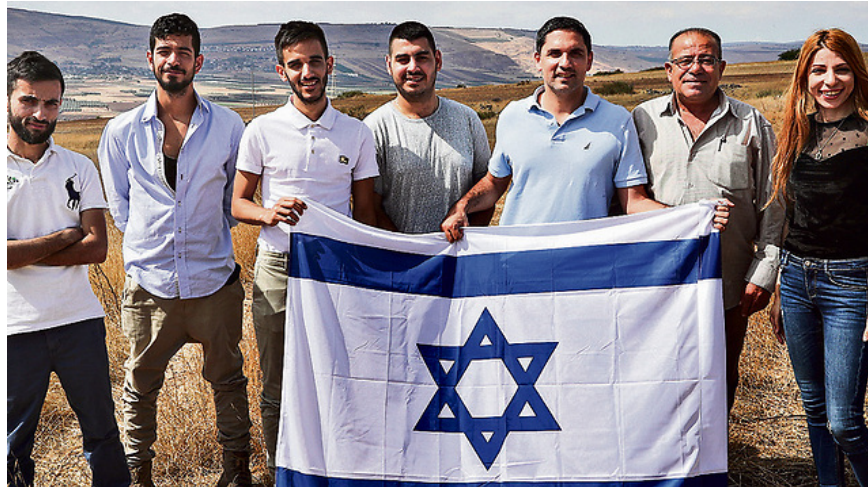
Israeli Arabs against BDS.

Israeli Arabs vote and run in all elections. They currently sit in the Knesset (Parliament), work in the government, and play an active role in the current government coalition. Arabs sit on the Supreme Court, work as full staff members of hospitals, work as lawyers and judges, serve in the military, pray in mosques, and attend all universities and professional schools in Israel.