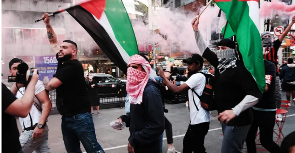
BDS protests turned violent, endangering Jewish students.

Attacks on Jewish students have reached over 1,000 in 2021 alone. These attacks have included historical antisemitic tropes directed at such youth (e.g. Jews control the banks and media and have single-handedly caused wars), bullying (e.g. harassment, violence, physical, emotional, and mental abuse), demonization of Israel, denigration, discrimination (loss of job opportunity, lowered grades in courses, humiliation in class), genocidal expression (denigration of Holocaust and Jews in general), denial of Jewish self-determination, and the destruction of Jewish property.