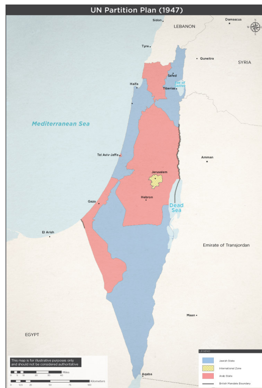
UN Partition Plan (1947).

area today comprising the State of Israel, Judea and Samaria (commonly known as the West Bank) and Gaza.