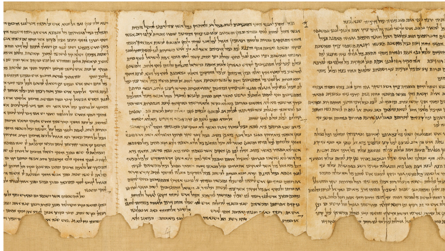
The Dead Sea scrolls, ancient Jewish and Hebrew texts, discovered in Judea. The scrolls include no Christian or Muslim texts.

and occupations (Assyrians in 722 BCE, Babylonians in 586 BCE, Persians in 539 BCE, Greeks in 331 BCE, Romans in 63 BCE, Muslims in 636 CE, Crusaders in 1099 CE, Ottoman Turks in 1516 CE and the British in 1917), the Jews have been the only people who have been there consistently. Jews were already an ancient people in the Land of Israel when Muslims invaded Jerusalem in 636 CE.